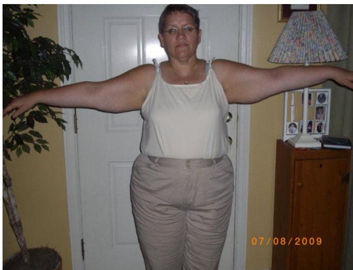
Before picture taken 7/08/09; Pants size 22

I know I am going to be ok on the second part of this journey.